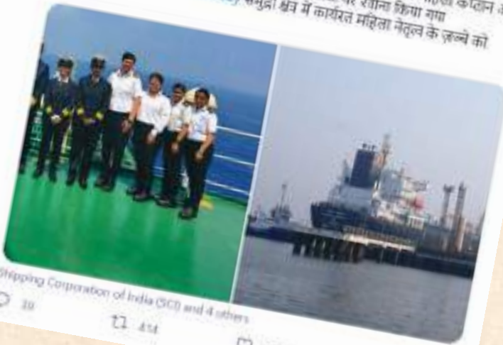
Shipping Corporation of India (SCI) and 4 others

Mansukh Mandaviya @mansukhmandaviya · Mar 7 भारतीय नारी शक्ति सदैव अतिहास बनाती है। विश्व इतिहास में पहली बार एक 'कार्गो जहाज' (एमटी सर्व कृष्ण) की महिला कप्तान और कप्तान महिला अधिकारियों की टीम के साथ समुद्री यज्ञ पर खाना किया गया इस #InternationalWomensDay समुद्री क्षेत्र में कार्यरत महिला नेतृत्व के ज़रूरी को सलाम