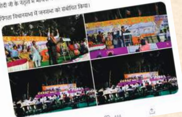
BJP and 7 others

Mansukh Mandaviya @mansukhmandaviya · Mar 29 समय बदल रहा है, देश आगे बढ़ रहा है लेकिन बंगाल देशकों से कुशासन के चलते वहाँ का वर्षा है। मोदी जी के नेतृत्व में भाजपा बंगाल में विकास के नये आयाम तय करेगी। पिंगला विधानसभा में जनसभा को संबोधित किया।